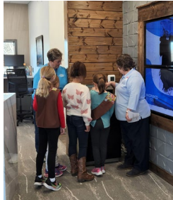
We partnered with the NE KS/ NW MO Girl Scouts to hold a financial literacy event so Brownies (2nd-3rd graders) could earn a budget badge. They learned about spending money wisely, wants & needs, and how to save. And they played Frontier Jeopardy and shopped for prizes at the end.